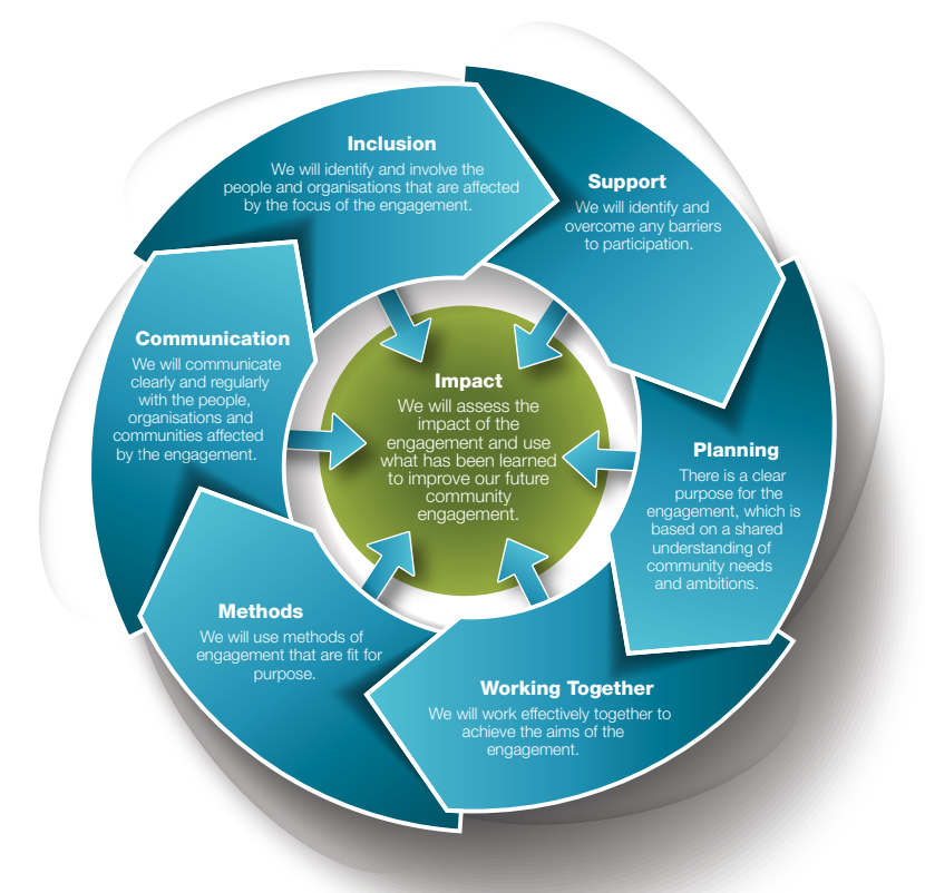
Figure 1: Seven Scottish National Standards for Community Engagement

The National Standards for Community Engagement